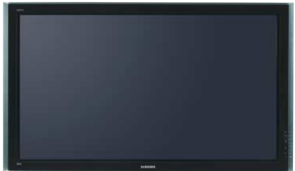
The World's First Full High Definition 70" Plasma TV