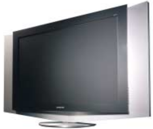
The World's Largest (54") LCD TV

Being the world's leading LCD panel maker with the second largest share of the world LCD TV market, Samsung is launching at IFA 2003 in Berlin a new, affordable 32" LCD TV with superior viewing quality and complete home theatre capabilities. The LW32A23W features Samsung Electronics' proprietary DNe™ (Digital Natural Image engine) and premium LCD panels incorporating PVA (Patterned Vertical Alignment) technologies for superior images. This latest product also delivers a 600:1 contrast ratio, 500cd/m 2 brightness and 170/170-degree viewing angle. The Samsung Electronics 32" LCD TV is also embedded with Dolby Digital function and supports 5.1 channel sound to provide a complete home theatre experience.