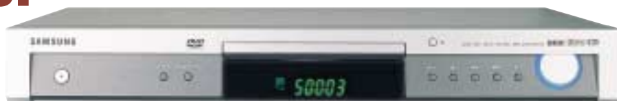
The world's first HDTV-compliant DVD player (DVD-HD935)