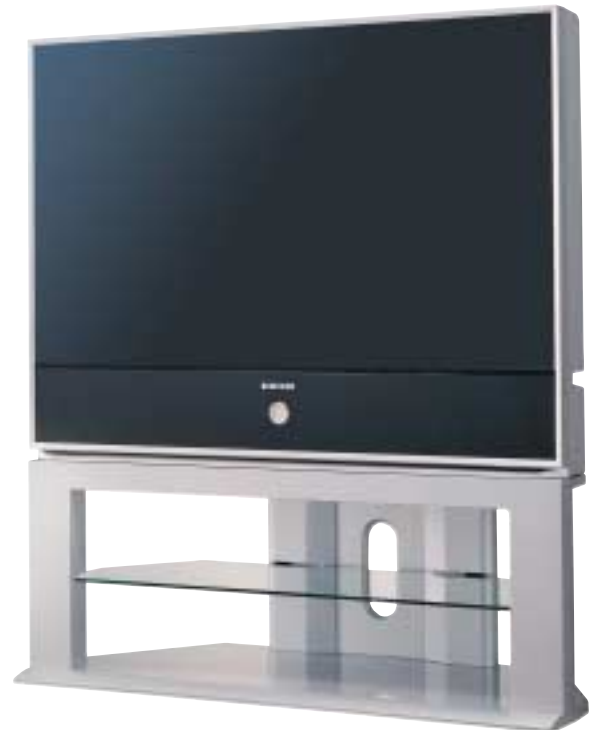
The State-of-the-Art rear-projection television (SP46L5H LCD)

Up until now, when we asked potential buyers about their views concerning Rear-projection TV, the first concern cited was that of poor image quality and viewing angle. One look at the new Samsung models tends to change people's attitudes rather rapidly. These screens are now even sometimes chosen as a substitute for Plasma when wall hanging is not an issue.