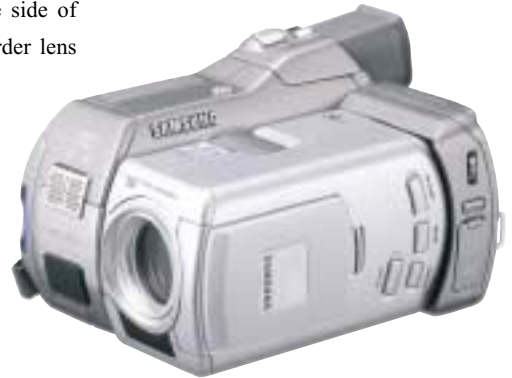
VP-D5000i, the latest in Samsung’s line of digital convergence products