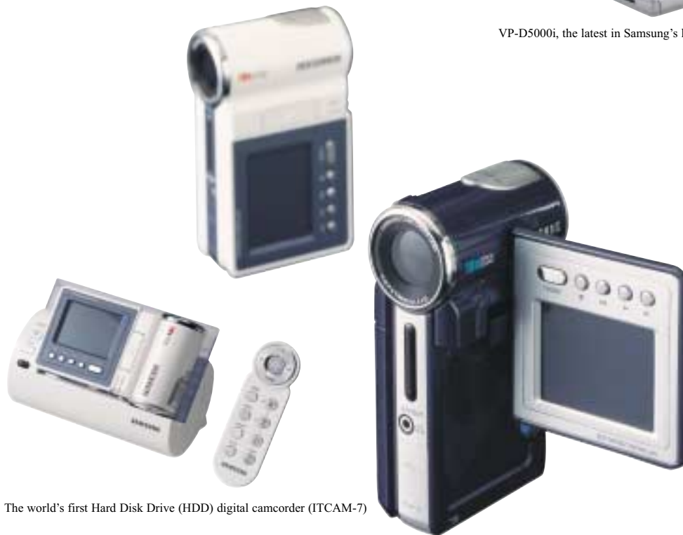
The world’s first Hard Disk Drive (HDD) digital camcorder (ITCAM-7)

Again, in the digital imaging world, Samsung have apparently taken the time to listen to the market, and are not fearing to break new ground and lead the way with ideas such as those launched here. One might ask oneself, “why hadn’t anyone thought to make units like this before?”... the answer is of course that the engineering skills required are more difficult than they originally seem. Proof of the prowess of the Korean giant.